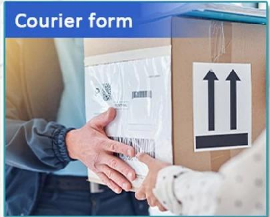
Warehouse Label Printing