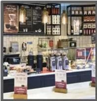
Mile Tea Store