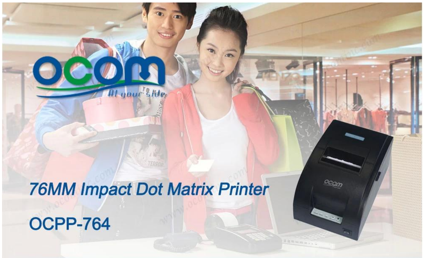
76MM Impact Dot Matrix Printer OCPP-764