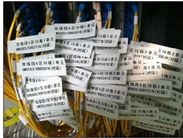
Network Information Label