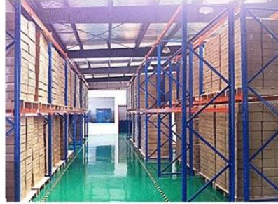
Raw Materials And Semi-FG Products