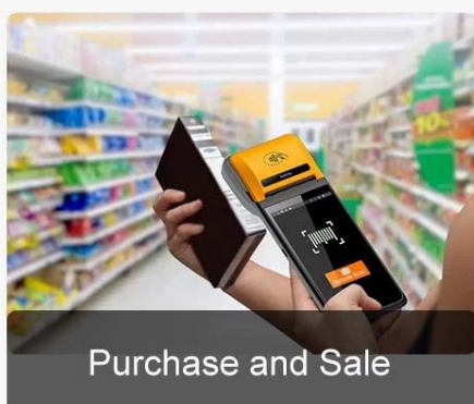
Purchase and Sale