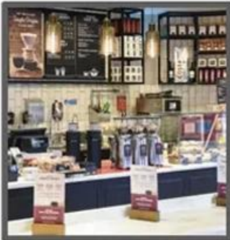
Mile Tea Store