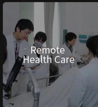
Remote Health Care