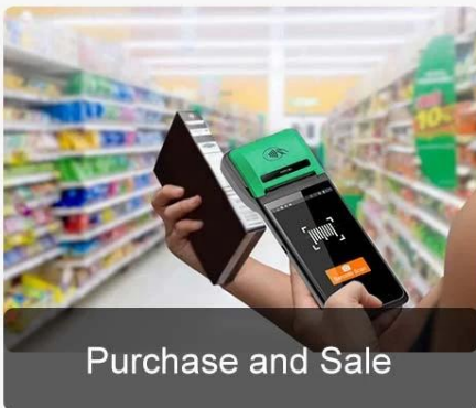
Purchase and Sale