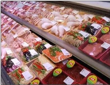
Fresh Food Supermarket