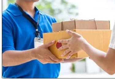
Express & Logistics