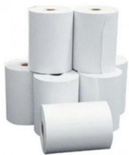
Thermal Receipt Paper Paper Width: 80mm Roll Dia: Max. Ø 80mm

Without the printing ink and ribbon etc traditional consumables, Low material cost. 48 or 80mm adjustable paper separator for option