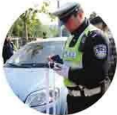
Traffic police enforcement