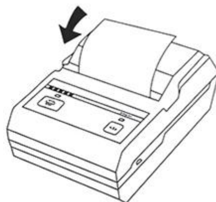
Step three Close the cover