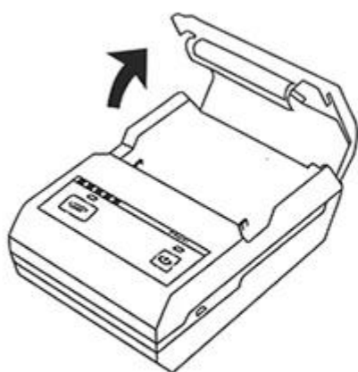
Step one Open the cover according arrow direction