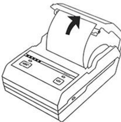
Step two Load roll paper according arrow direction