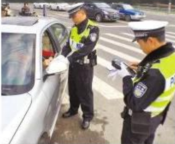
Inspection Law Enforcement