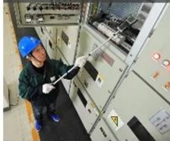
Electricity Meter Reading