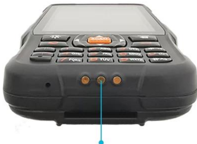
POGO PIN Interface

Professional POGO PIN interface, fast charging, reduce the loss of batteries and mainframe at the same time.