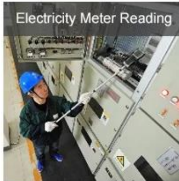
Electricity Meter Reading