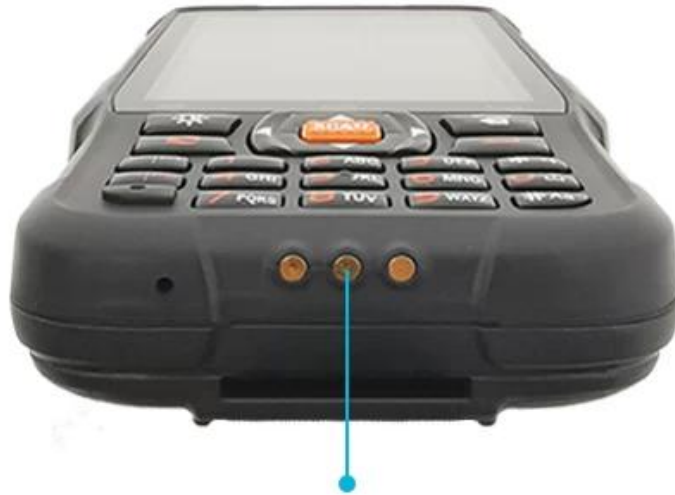
POGO PIN Interface

Professional POGO PIN interface, fast charging, reduce the loss of batteries and mainframe at the same time.