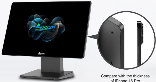
Compare with the thickness of iPhone 16 Pro

Only 10.5mm thick, ultra-thin bezel design