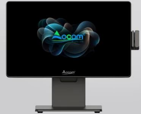
With MSR or MSR+NFC