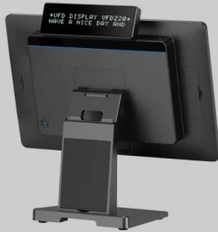
With customer display