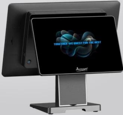
With secondary screen