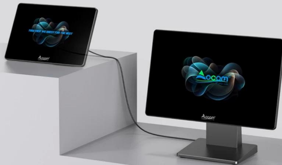
With one line connection 2nd screen