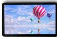
↙ ↘ 15.6 inch