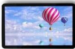
↙ ↘ 15.6 inch