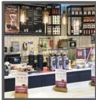
Mile Tea Store