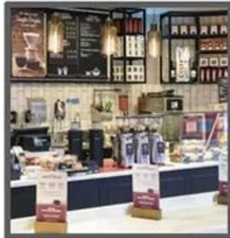
Mile Tea Store