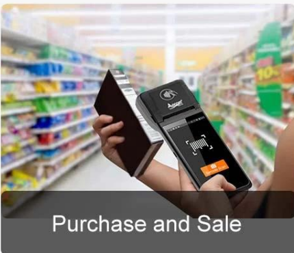
Purchase and Sale