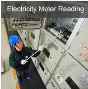
Electricity Meter Reading