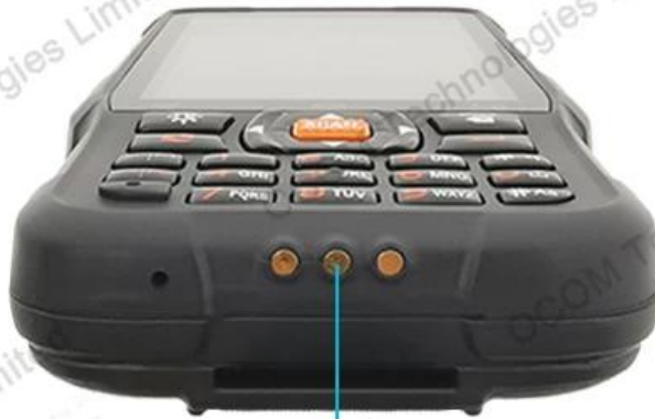
POGO PIN Interface

Professional POGO PIN interface, fast charging, reduce the loss of batteries and mainframe at the same time.