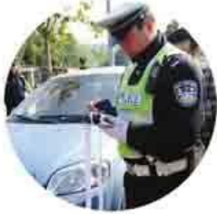
Traffic police enforcement